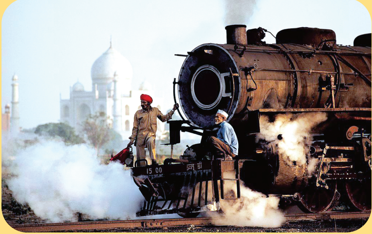
Answers: 1. Minar of Tajmahal, 2. Red turban, 3. Lantern in the hand, 4. Locomotive grill, 5. Smoke from the top